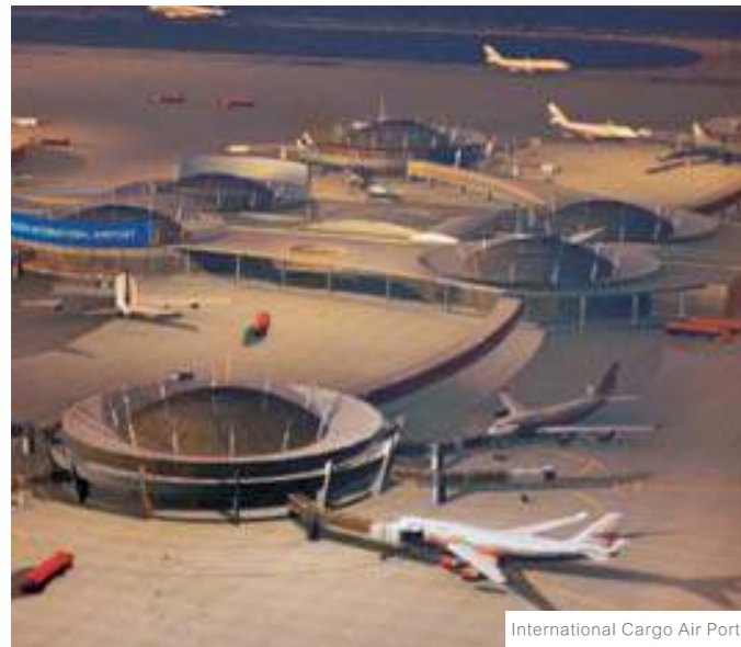
International Cargo Air Port

Dholera Had Been A Flourishing Port In Gujarat With A Prosperous Trade Till Early 18th Century. The Glory Of Past Is Revisiting Dholera With The Launch Of Special Investment Region (SIR), The First In Gujarat. Coming Up With Various Development Zone And World Class Infrastructure The SIR Will Be Linked Across Gujarat With Expressways, Metro Rail And International Quality Airport And Port In Close Vicinity.